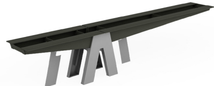
Inverse "V" Base Cable Management Covers