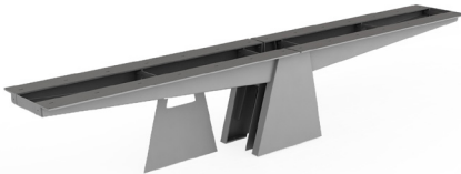
Triangle Base w/ Inner Cable Management Covers