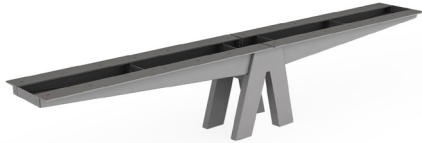
Inverse "V" Base