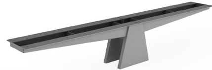
Triangle Base (seated only)