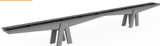
Bases can be paired for longer Conference tables