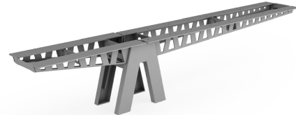
Truss Design Support Cantilevers (cantilever trough covers not included)