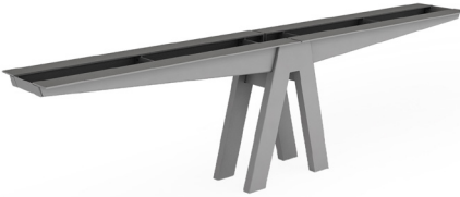
Centered Cantilever Supports (tops up to 60"D x 240"W)