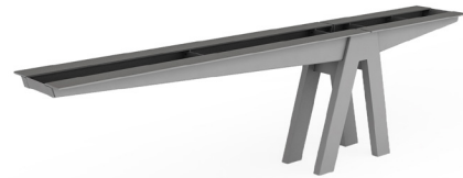
Offset Cantilever Supports (tops 60"D x 120"-192"W)