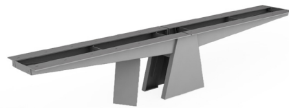
Triangle Base w/End Cable Management Covers (fully enclosed base)