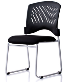
Fabric Seat V5000SF

Whether the activities in your space change by the hour, or remain consistent throughout the day, the Monaco collection delivers. Monaco's lightweight yet sturdy design is perfect for cafés, multi-purpose rooms, breakrooms, and event spaces throughout your building. The perforated contoured back provides just the right support, and the upholstered fabric seat maintains comfort for a longer term sit.