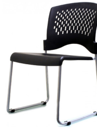
Poly Seat V5000S