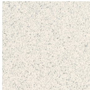
Studio White Matrix