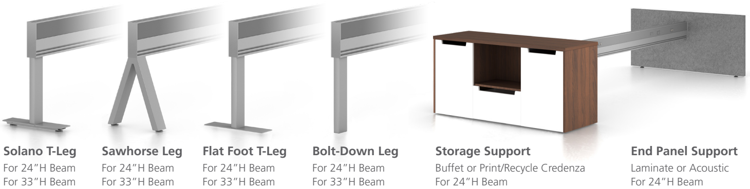
Solano T-Leg For 24" H Beam For 33" H Beam