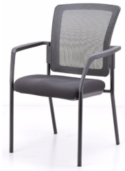
Me! Guest MEGG

The Me! collection offers the ultimate scalability with four task chair models, a stool, a 4-leg guest chair, and a mobile nesting chair. If consistent aesthetic is important to your customer, Me! is the right place to start.