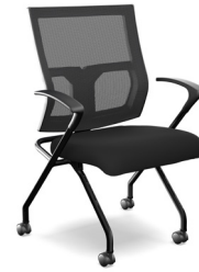
Me! Flip Nest MENEST